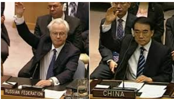
Russia and China attempt to prohibit space weapons at the United Nations.

President Obama has in the past called for the abolition of nuclear weapons. The Russians, watching an advancing NATO and MD deployments near their borders, are telling the world that any real hopes for serious nuclear weapons reductions are in jeopardy.