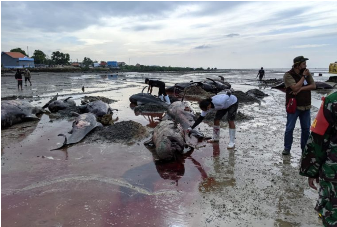
The pilot whales in Madura.

Researchers are now trying to figure out why the whales ended up on land, just the latest mass beaching incident in the country with the world's longest coastline.