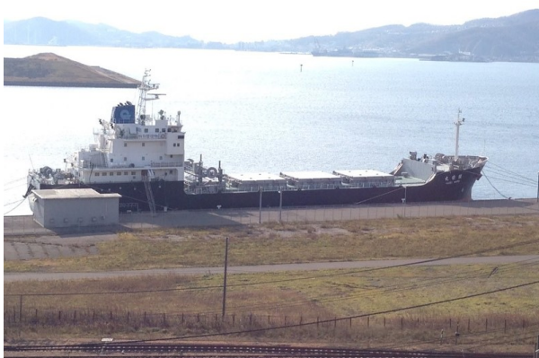
The Nuclear Fuel Carrier Kaieimaru

Of the Japanese central government’s over 5000 spending programs, 55 have been chosen for this year’s review. While that number may seem small, as noted earlier these programs total over YEN 13.6 trillion and thus represent over 10% of the proposed YEN 102 trillion fiscal appropriations for the 2016 budget. Given that Japan’s public debt load of 226% of GDP is unprecedented in the history of the OECD, 8 the pressure for cuts is likely to be stronger than in previous years. Particularly significant is the fact that the items slated for review are heavily oriented towards energy. Indeed, fully 24 of the 55 items are energy- and environment-related, and the vast majority of those are devoted to nuclear facilities as well as to measures related to achieving the recycling of nuclear waste in breeder reactors. 9