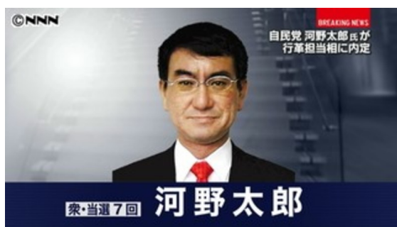
Kono Taro enters Abe Cabinet, Oct 7, 2015

In addition to numerous public appearances, books, and interviews in which he was critical of the nuclear village and its dominance of the Japanese power industry, he maintained a blog with regular contributions critical of the Fukushima incident and its aftermath. He also criticized the Abe government's efforts to restart nuclear reactors.